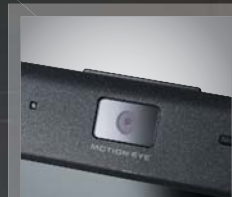
Motion Eye Camera