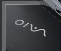
Aroma Black Surface